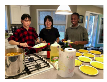
Food, Food, and more FOOD