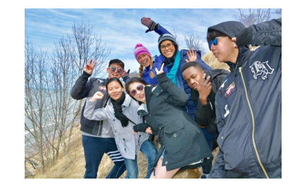
Hello Lake Michigan!